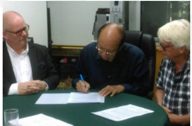
Signing of Partnership Agreement between IBRA Media and Voice of Peace

The Danish Covenant Church has supported Voice of Peace each month for all 50 years of ministry.