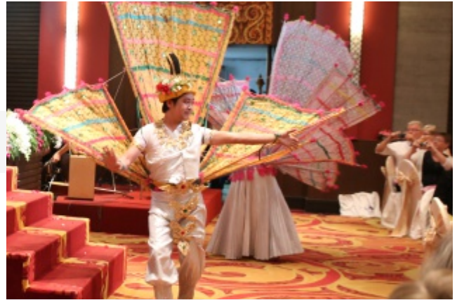
Dancers and singers from Christian Communication Institute, Payap University presented beautiful dances of congratulation and blessings.