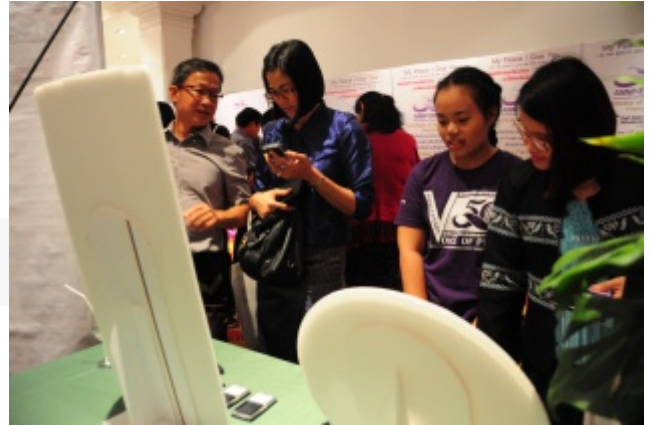
The Voice of Peace staff had prepared many posters and exhibitions, including a timeline of the Voice of Peace history.