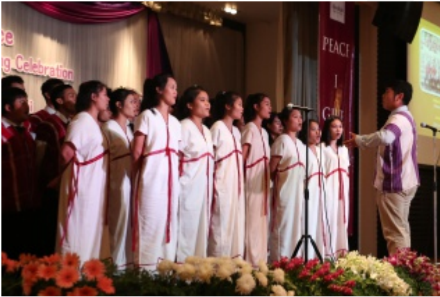
A choir from Siloam church and seminary presented two songs in Karen Language. Musical presentations during the dinners was by the group "Sing Out" and other Christian groups in Chiang Mai.