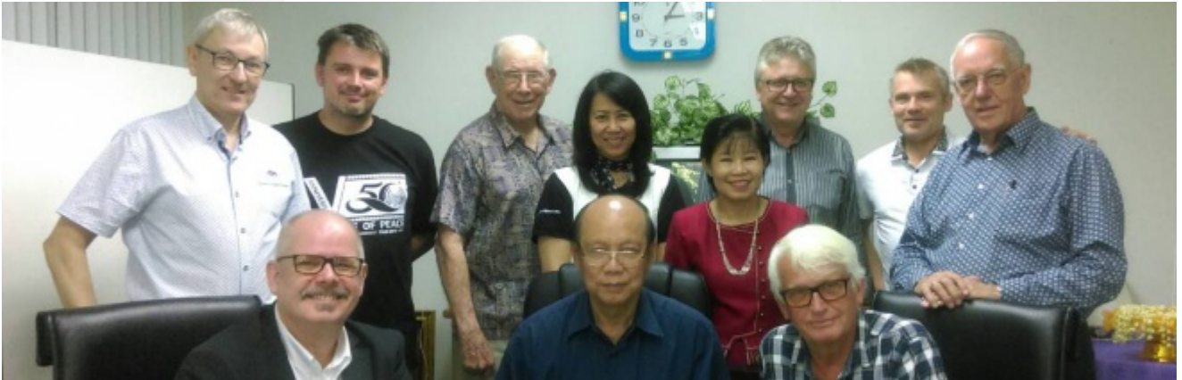
A blessed meeting between representatives between the Danish Covenant Church, IBRA Media and Voice of Peace.

A special meeting took place at Voice of Peace with Voice of Peace board members and leaders from the Danish Covenant Church and from IBRA Media in Sweden.