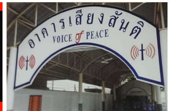
The big sign on the Voice of Peace hall which is constructed inside the prison compound.